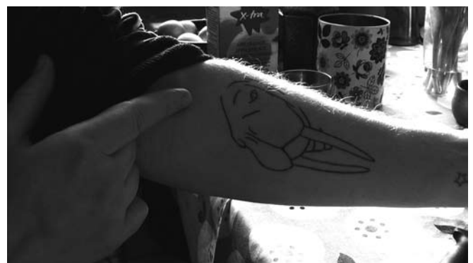
Hannes i filmen Walrossarna av Kolbjörn Guwallius. Foto: Kolbjörn Guwallius. (c) 2006.