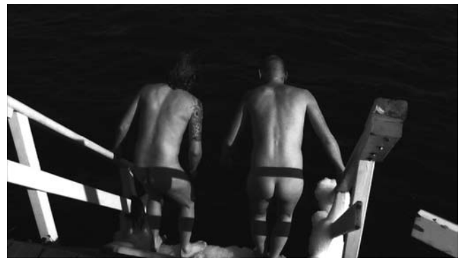
Hannes och Kalle i filmen Walrossarna av Kolbjörn Guwallius. Foto: Kolbjörn Guwallius. (c) 2006.